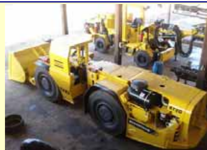
Investments at Palito are resulting in improved productivity and reliability; last quarter Serabi took delivery of a new jumbo drill rig and scooptram which will provide further benefits to the operation during 2007